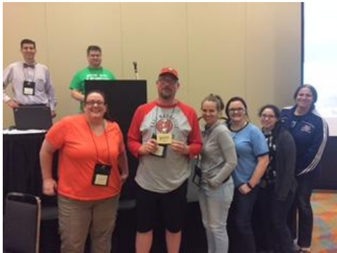
3 rd Place Non-Prophets