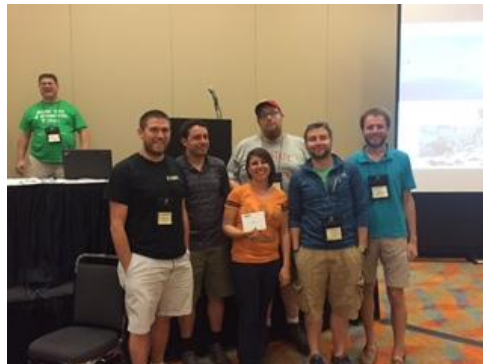
2 nd Place Can't State